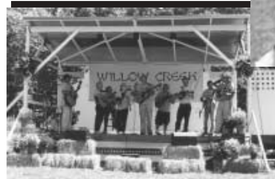
The Glory Bound Band plays a gospel set