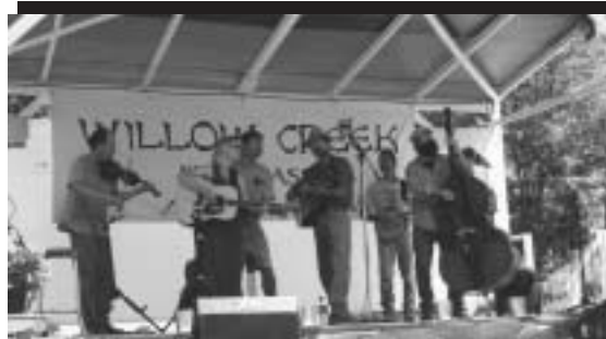
Local favorites Oxford Depot