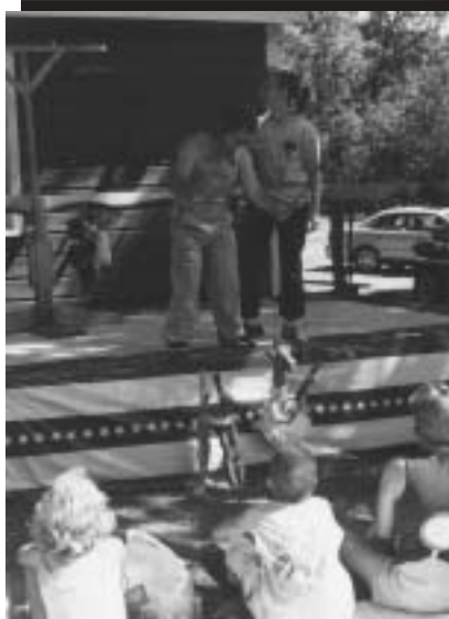
Emcee Doctor Nick puppeteering at the kids' stage