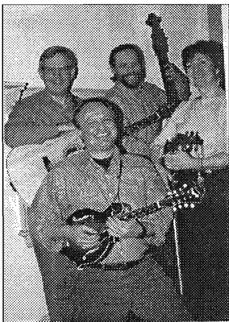
Catch The Wickers Creek Band at the Winter Fun-raiser

The Wickers Creek Band makes its first appearance at an HVBA event playing an eclectic mix of traditional American music with a heapin' helpin' of bluegrass influence. The quartet is reknowned for close harmonies and a repertoire ranging from classic and contemporary bluegrass, country and Appala-